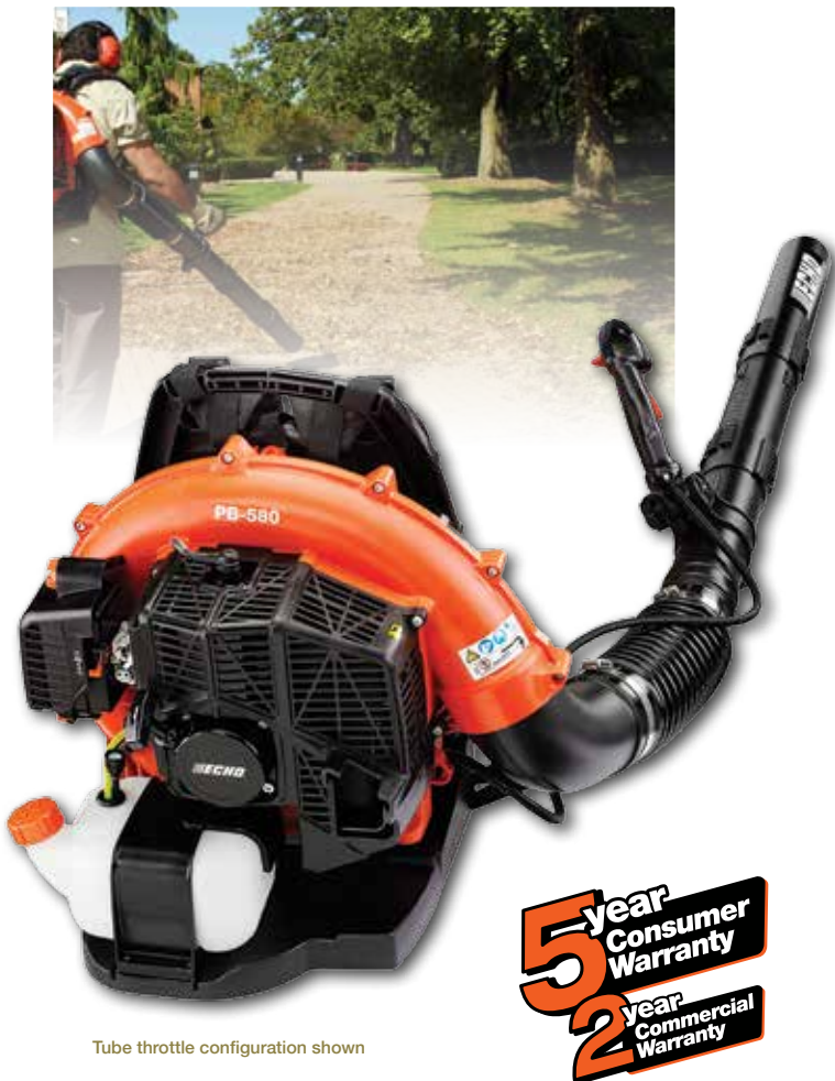
Tube throttle configuration shown

MARKET LEADING PERFORMANCE: COMBINATION OF ECONOMICAL PERFORMANCE, DEPENDABILITY AND COMFORT